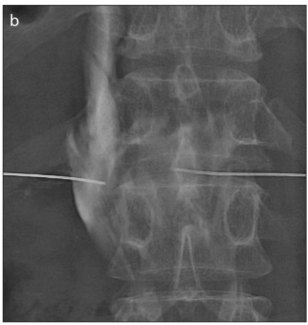
Figure 2. a, b. Images of a man in his 50s with pancreatic cancer who underwent splanchnic nerve neurolysis. Axial CT image ( a ) shows the bilateral distribution of contrast medium in the retrocrural space. Right-sided puncture is often performed via the intervertebral disc. In image ( b ), the distribution of contrast medium in the craniocaudal direction is easily observed with X-ray fluoroscopy. In this case, the contrast medium was distributed within the range of 3 vertebral bodies.

drugs) on the day following the procedure and 1–2 weeks later.